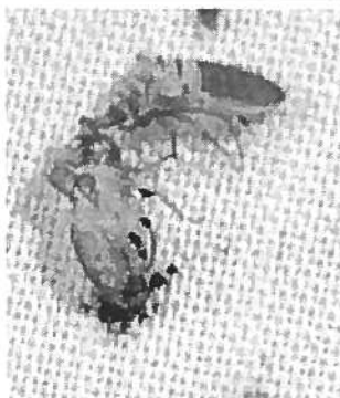
Photo 3. Bed Bug Exoskeletons. http://www.afpmb.org/netpub/server.np?quickfind=animals-insects-bedbugs&catalog=catalog&site=Dossier&template=detail.np&offset=9&start=1122

Bed bugs are experts at hiding. They hide during the day in places such as seams of mattresses, box springs, bed frames, headboards, dresser tables, cracks or crevices, behind wallpaper, and under any clutter or objects around a bed. Their small flat bodies allow them to fit into the smallest of spaces and they can remain in place for long periods of time, even without a blood meal. Bed bugs can travel over 100 feet in one night, but they tend to live within 8 feet of where people sleep.