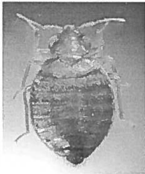
Photo 1. Bed Bug.

The Centers for Disease Control and Prevention (CDC) and the U.S. Environmental Protection Agency (EPA) developed this document to highlight emerging public health issues associated with bed bugs ( Cimex lectularius ) in communities throughout the United States.